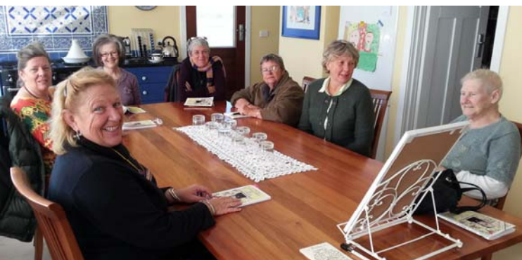
Left: learning to play Bridge