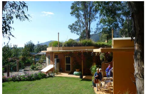
Right: Brogo Underground House tour