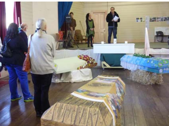
Left: opening of Demystifying Death & Dying Forum with some hand-decorated coffins