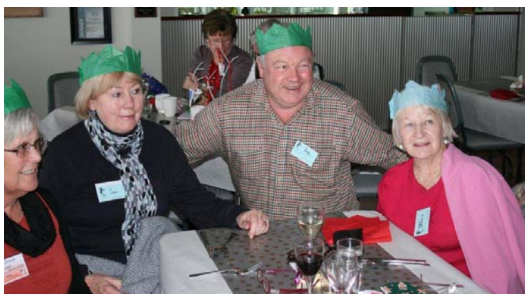
Christmas in July combined with Sapphire Coast U3A