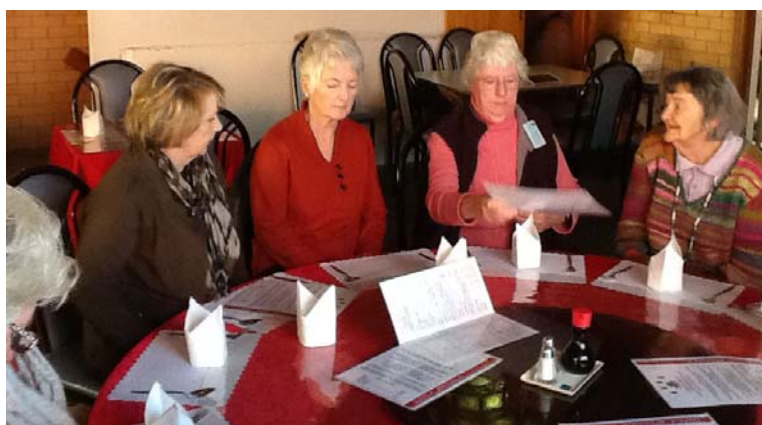
Lunch after seeing a film at the Kinema