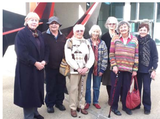
Turner from the Tate exhibition at the National Gallery last term— worth the trip