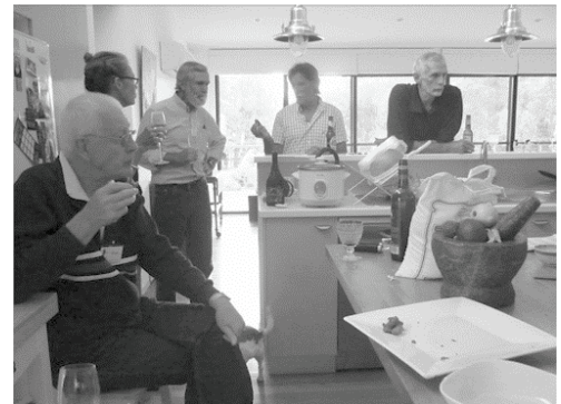
The hangers on wait for a free feed (note how many men)